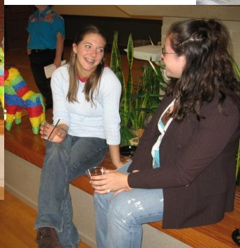
study abroad program this summer.