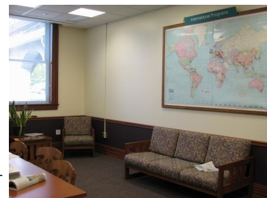
Student Lounge at CRH

"The school and students are wonderful - I'm having a wonderful time!" Kayla Whipkey (May 2005 graduate)