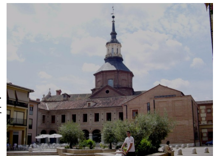
Colegio de los Irlandeses where language classes are taught in Alcalá de Henares

My semester in Spain quickly flew by, and before I knew it I was on a plane again, this time headed back to Pittsburgh. However, my Spain trip is one that I truly will never forget. In those four months, I met so many wonderful people, (some with whom I still communicate), traveled to numerous fascinating places, and of course, reinforced my strong love for the Spanish language and culture.